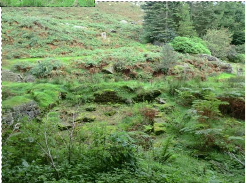
One of the cells and walling