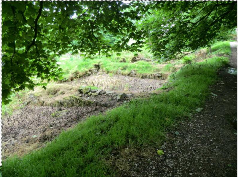
Two of the cells – with foliage cleared