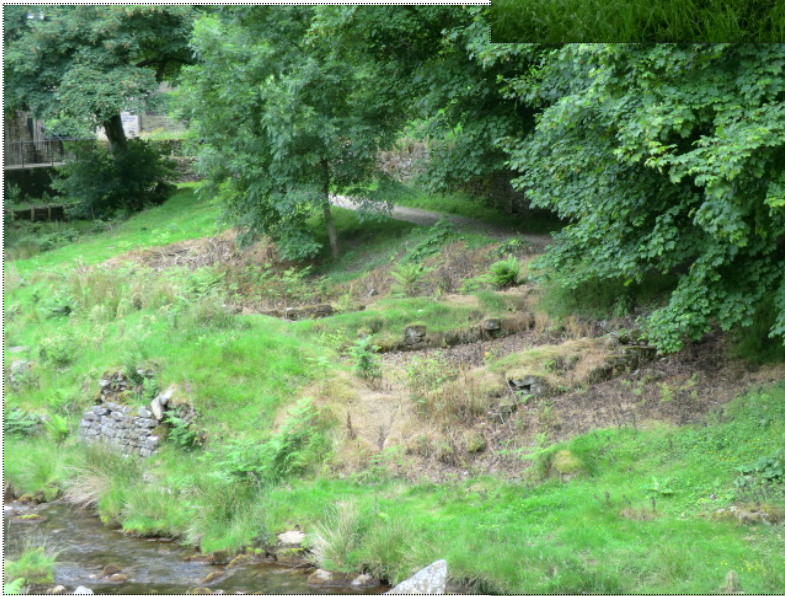
A view of the 'bunker' from another position